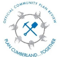
PHOTO & PRIZE CATEGORIES