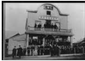
2. Kuomintang Building (Chinese Nationalist League) Circa 1920. CMA Co40-020.