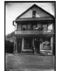
10. Sun On Wo General Store and Joy Lin Low Restaurant Circa 1920s.