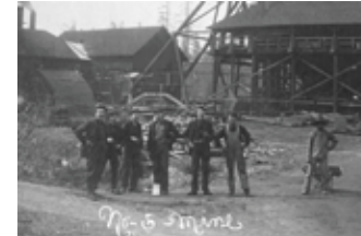
14. Discrimination in the mines. Circa 1912. CMA C165-007.