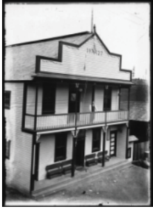
16. Dart Coon Club 1927. CMA Co40-023.