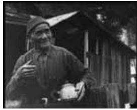
7. A Bachelor Community Jao Hong. 1967. CDM 981.25.2b