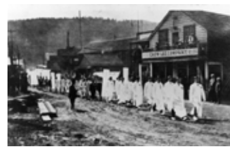
8. The Importance of Ritual Funeral procession in front of Chow Lee Co. Store. 1917. CMA Co40-302.