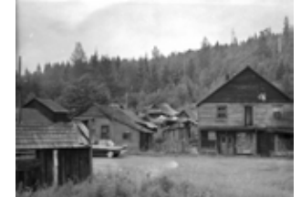
15. The Decline of Chinatown Buildings in Chinatown. 1960. CMA Co40-009.