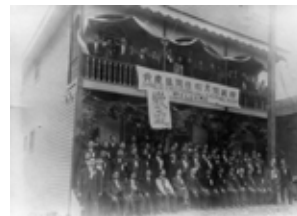
13. Chinese Freemason Hall (The Chee Kung Tong) Circa 1920. CMA Co40-071.