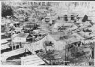
1. Cumberland Chinatown A thriving community. 1910. Cumberland Museum & Archives (CMA) Co40-001.