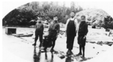
12. Children of Chinatown Circa 1920s. CMA Co40-074.