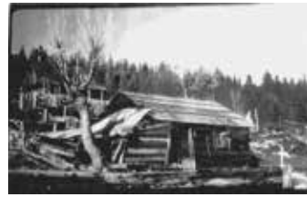
3. Site of Jumbo's Cabin When Hor Sue Mah (Jumbo) resided in it.