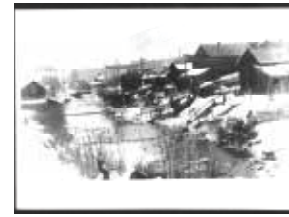
4. Boundary Creek Circa 1910. CMA Co40-341.