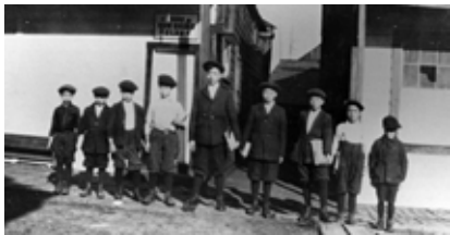
11. Sons of Merchants Early 1920s. CMA Co40-145.