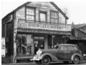
6. Chow Lee Company Circa 1940's.