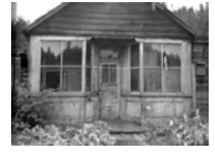
5. Wah Sang Bakery Circa 1960. CMA Co40-018.