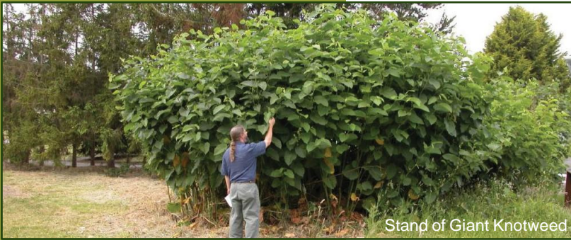
Stand of Giant Knotweed