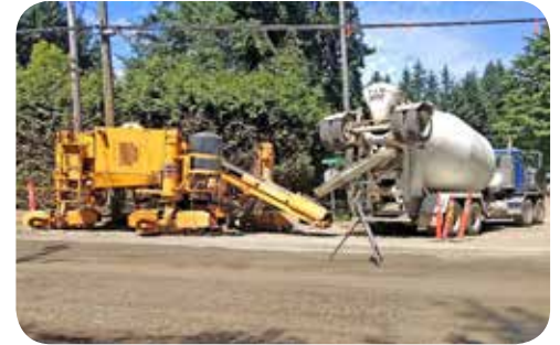
Above and top right - Paving crew; Bottom right - Pouring concrete curbs.