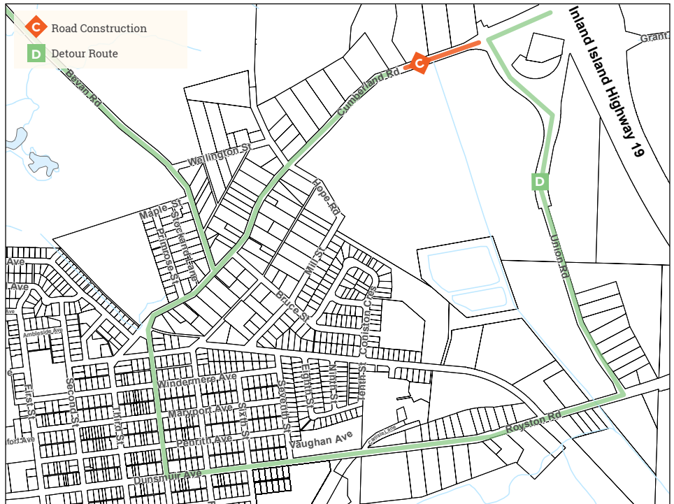
Updated Construction Detour Map

While single lane, alternating traffic will be maintained during construction hours, motorists are encouraged to use the detour route to assist with the efficiency and safety of the work. All homes and businesses are now easily accessible through the Village core.