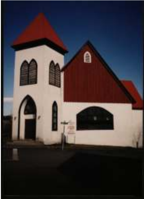
Cumberland United Church 2688 Penrith Avenue, Cumberland BC