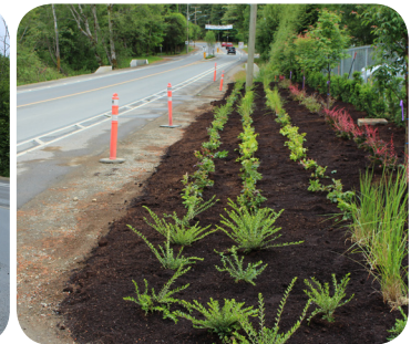
Paving and landscaping progress along Cumberland Rd.