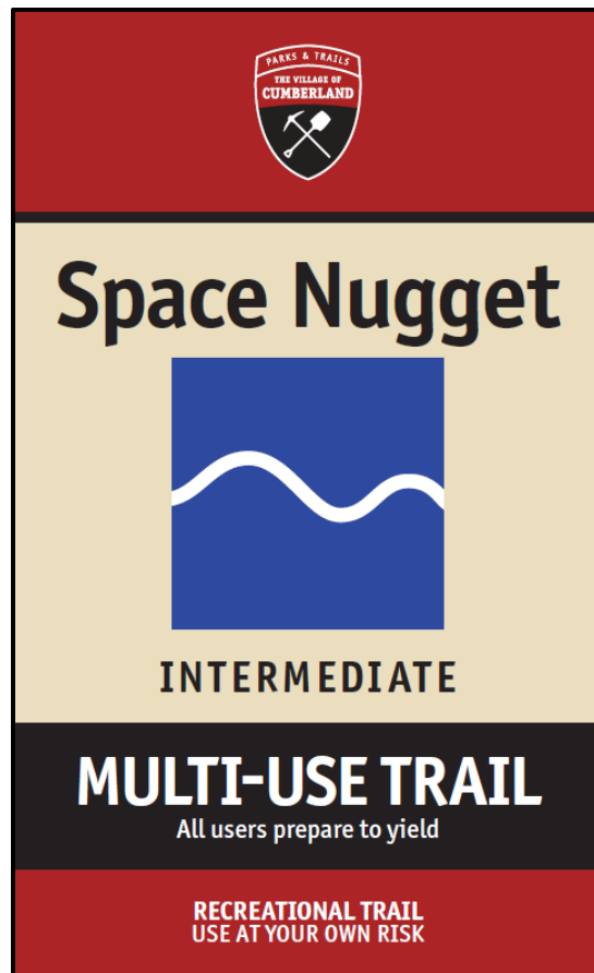
Example of a standard Village trail sign.