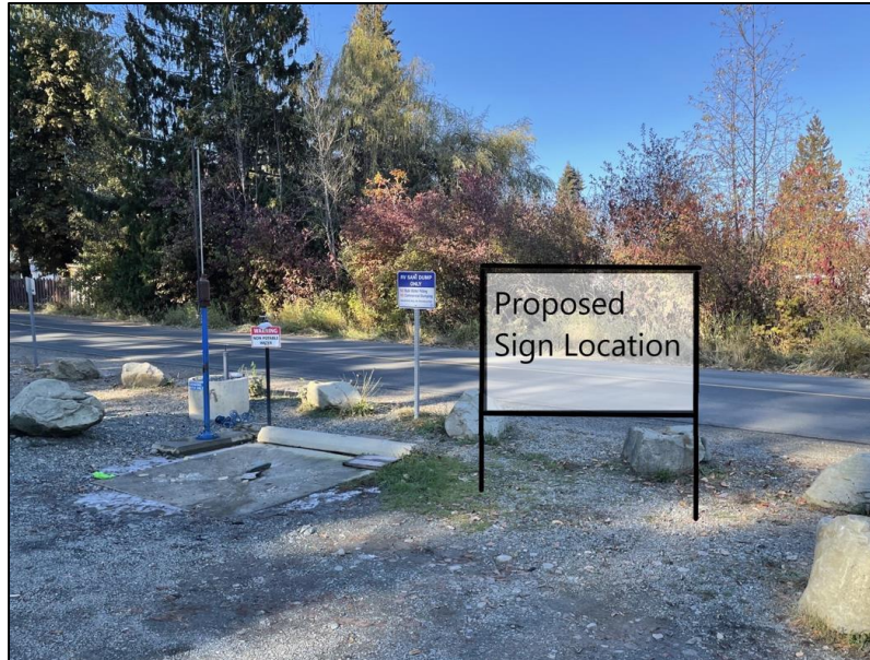
Figure 2: Proposed sign location adjacent to the RV sani-station at Village Park on Royston Road.