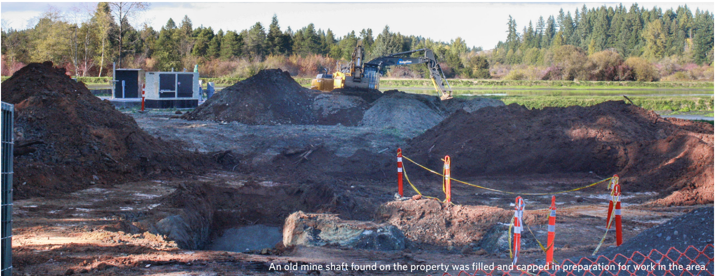
An old mine shaft found on the property was filled and capped in preparation for work in the area.

Hello from the Village of Cumberland's Wastewater Upgrades Project team. This is our fifth issue of our project update newsletter which will keep you informed on progress on this important infrastructure upgrade. For more information and ongoing updates, check out the website at www.cumberland.ca/wastewaterupgrades