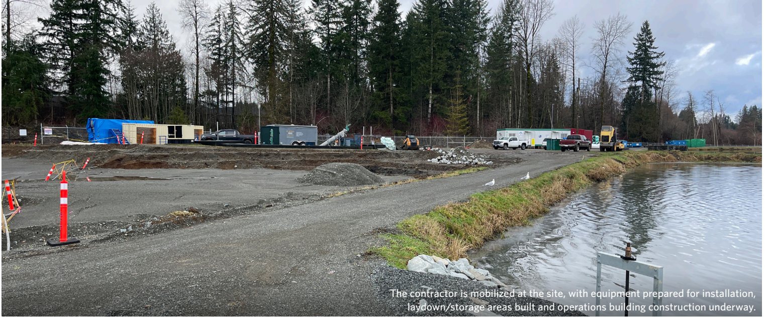
The contractor is mobilized at the site, with equipment prepared for installation, laydown/storage areas built and operations building construction underway.