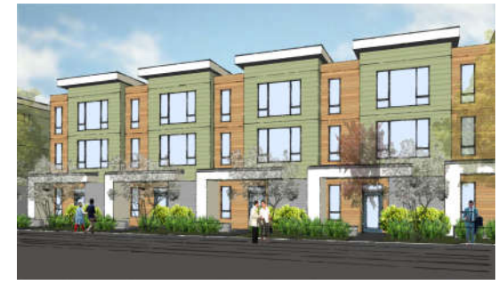
OVERSIZED RESIDENTIAL PATIOS ALONG ULVERSTON: • GROUNDS THE BUILDING • ACTIVATES SITEWALK AND STREETScape