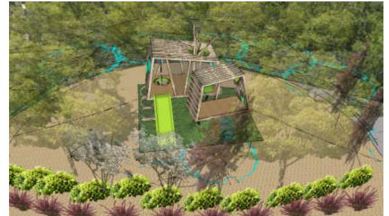
AMENITY SPACES: • PLAYGROUND AS FOCAL POINT IN THE CENTER OF SITE • WALKWAY TRAIL NETWORK ACROSS SITE